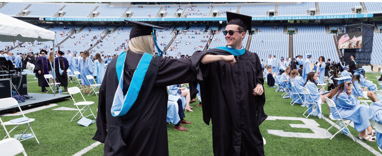
MPA graduates greet each other at a UNC outdoor ceremony in May 2021.